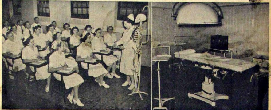
Although there are two modern operating rooms at the Cresson Sanatorium, they are used only for minor chest surgery. They could be utilized for all types of operations if the hospital had the services of the necessary number of nurses with operating room experience. At present there is only one. Six are needed. Some of the leading surgeons of the Johnstown district are consultants at the institution and could perform many necessary operations if nurses were available. Patients requiring surgical treatment must be sent to hospitals in Altoona or Pittsburgh. In an effort to solve the nurse shortage problem the institution has instituted a student nurse training. The present class is composed of 13 women and eight men. On completion of a year's course, they will qualify as practical nurses. Many beds also are vacant in the Cresson institution due to the lack of trained personnel. The same situation exists at Mt. Airy and Hamburg, according to state authorities.